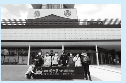
Group photo at the museum

Gifu Sekigahara Battlefield Museum / Historic Site Tour (Sekigahara-cho) After experiencing the Battle of Sekigahara and the Warring States Period viscerally in the museum's theater and viewing tower, there was a tour of archaeological sites with a guide to help understand Gifu Prefecture's historical assets.