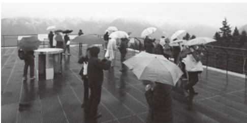
▲ Shinhotaka ropeway; view from the observation deck

On the first day, the tour group experienced Japanese sword forging in Seki, and Mino washi papermaking, as well as wandering the traditional streets of Mino city. Each participant was able to experience aspects of the traditional industries of Gifu Prefecture, such as hitting iron heated to high temperatures with a mallet during the sword forging, and making their own unique sheet of washi paper during the papermaking experience.