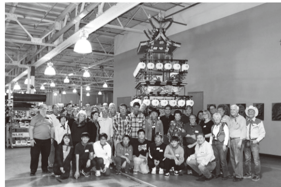
Repairing the model Yatai, 2019