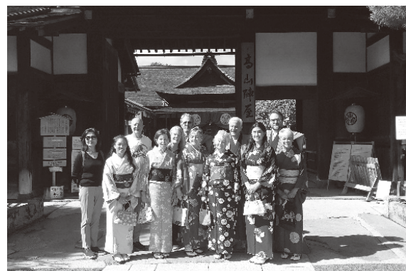
Denver delegation at Takayama Jinya