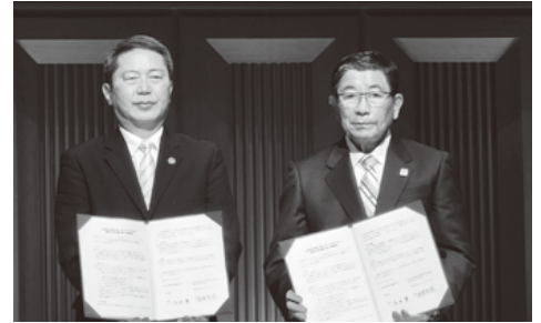
▲ Signing of a memorandum of understanding between Gifu Prefecture and GKI on the overseas expansion of prefectural products

On the 30 th the attendees enjoyed cultural exchange activities which included the display and sale of prefectural products, the introduction of participating Kenjinkai, workshops to experience Gifu's traditional culture, and a presentation contest for youth study abroad support.