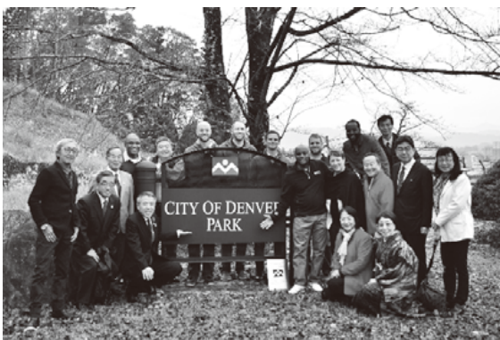
Friendship hill, Takayama