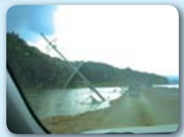
The road to Ishinomaki

At the beginning of the experience I wondered if there was anything I could really do, but actually going there reconfirmed my belief you don't actually have to go there to support reconstruction. Even though it's indirect, putting money in a donation box at a convenience store or buying fundraising merchandise will make a difference. Saving electricity is also an indirect form