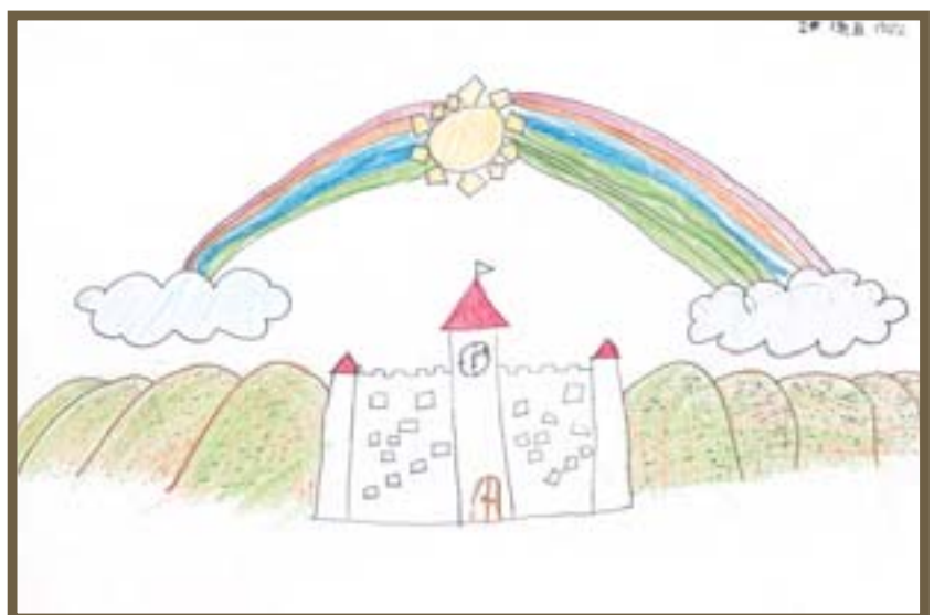
Seiya Chiba, ▶ 2 nd Grade Tokino Elementary School