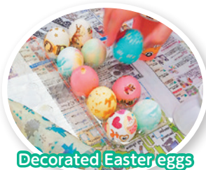
Decorated Easter eggs