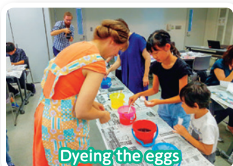
Dyeing the eggs