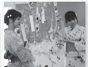
Experiencing Japanese Culture