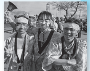
Taking part in Imao Sagicho

We work with the community to promote multiculturalism by holding Japanese cultural events such as Tanabata and New Years' festivals, and seminars led by firefighters to teach foreigners about what to do in a natural disaster. Japanese language students also participated in the 400-year old traditional festival "Imao Sagicho".