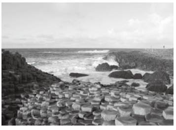
The Giant's Causeway

Before moving to Gifu, I was living in Northern Ireland, a part of the UK which makes up only 3% of the country's population. Although Northern Ireland shares a border with the Republic of Ireland to the south and west, when Ireland was partitioned in 1921, the North remained a part of the UK. As a result, Northern Ireland has a unique mixture of British and Irish culture. My family live by a small village near the capital city of Belfast. Our next-door neighbors are farmers who farm potatoes, barley, cows and sheep. The neighbors' children love farming, and the eldest has been driving a tractor around helping his dad since he started secondary school.