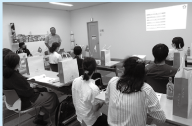
Eagerly attentive exchange students

This was the first time for many of the students to visit a business, and they were nervous at first. They actively asked questions and gave their thoughts, and had a good discussion with the businesses.