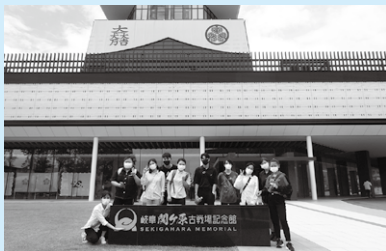
Group photo at the museum