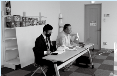
Presentations from business reps