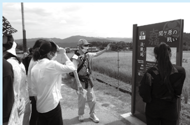
The Battlefield of Sekigahara

It was a chance to see the attractions of Gifu and Sekigahara while learning the history of the Warring States period.