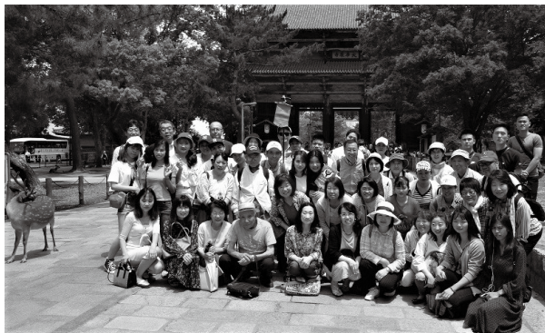
History Field Trip

The association's continuous, citizen-led international exchange activities were recognized in November of last year with an award from the Yoro municipal government, and this year in May with an all-Gifu Prefecture award for meritorious citizens. We hope we can continue to find joy in uniting Yoro with the people of the world, and continue offering learning opportunities about multicultural symbiosis, and enjoy the valuable meetings and learning opportunities through these activities for years to come.