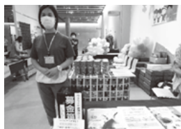
▲ Donation collection box