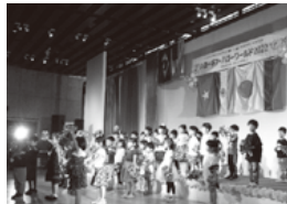
▲ Song and dance performance by kindergarteners