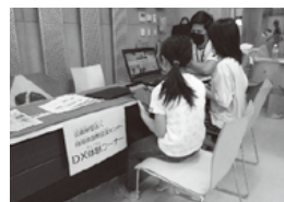
▲ Online game corner