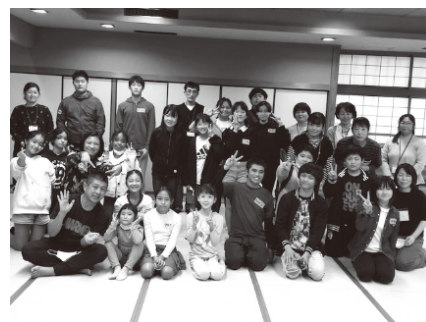
2021 dance workshop