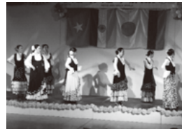
▲ Flamenco performance by the Gifu Spanish Cultural Center