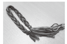
▲ Making a tautinė juosta