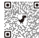
▲Game QR code

Here at the Gifu International Center, our Brazilian Coordinator for International Relations offers Portuguese classes every year to promote multicultural understanding and coexistence. The Portuguese language is spoken in 9 countries around the world, including Brazil and Portugal. In May, we ran an introductory level course, then in July a lower beginner's course, both of which were held online. During these classes online games were incorporated to make learning Portuguese fun, and teaching materials were provided using websites (such as Kahoot or Quizlet), which can only be experienced online. Below is a link to an online game where you can challenge yourself to learn Portuguese greetings, so please give it a go! (Inputting your personal details is not required, all you have to do is scan the QR code!)