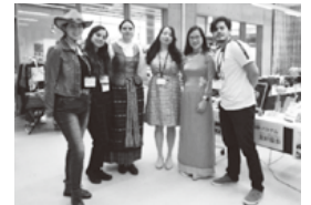
▲ Gifu Prefecture Coordinators for International Relations