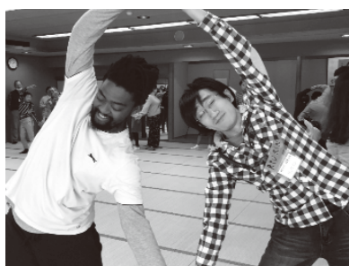
2019 drama workshop