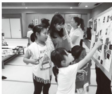
2019 photo workshop