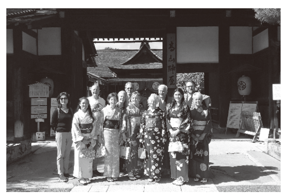
Denver delegation at Takayama Jinya