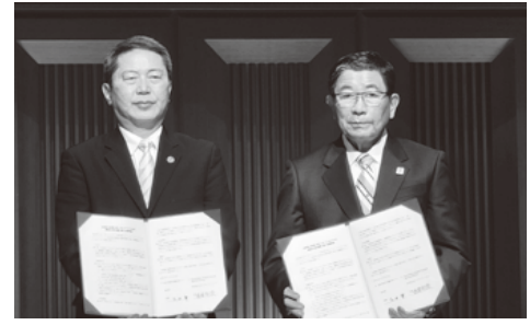
▲ Signing of a memorandum of understanding between Gifu Prefecture and GKI on the overseas expansion of prefectural products

On the 30<sup>th</sup> the attendees enjoyed cultural exchange activities which included the display and sale of prefectural products, the introduction of participating Kenjinkai, workshops to experience Gifu's traditional culture, and a presentation contest for youth study abroad support.