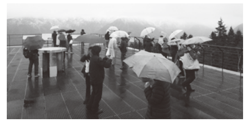
▲ Shinhotaka ropeway; view from the observation deck

On the first day, the tour group experienced Japanese sword forging in Seki, and Mino washi papermaking, as well as wandering the traditional streets of Mino city. Each participant was able to experience aspects of the traditional industries of Gifu Prefecture, such as hitting iron heated to high temperatures with a mallet during the sword forging, and making their own unique sheet of washi paper during the papermaking experience.