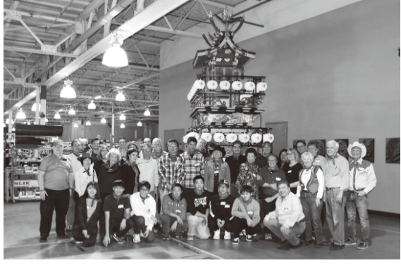
Repairing the model Yatai, 2019