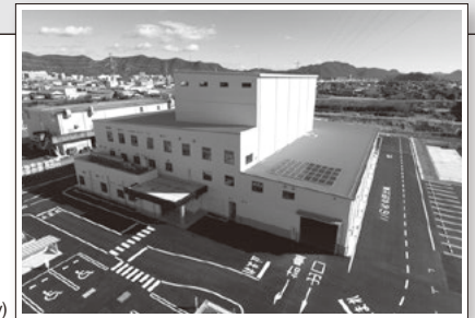
Gifu City Recycling Center (Gifu City)

The Gifu City Recycling Center is a facility that manually sorts four types of recyclable waste collected from households: cans, plastic containers and packaging, glass bottles, and plastic (PET) bottles. Which are then processed (storage and compression) before being transported to recycling plants.