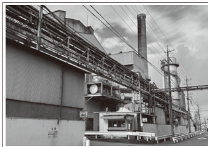
Nippon Taisanbin Kogyo (Ogaki City)