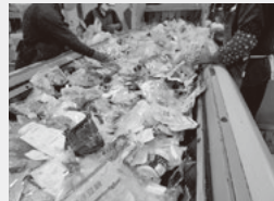
Hand Sorting of Plastic Packaging

Workers manually remove very dirty items and non-recyclable materials.