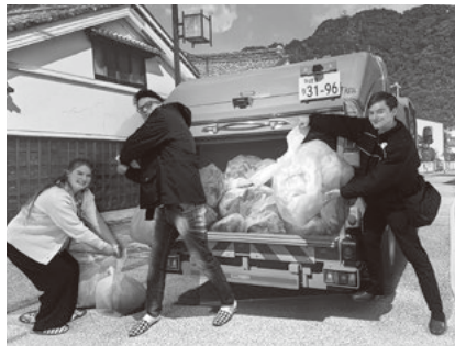
Getting Up Close to a Garbage Truck! (This is trick art!)