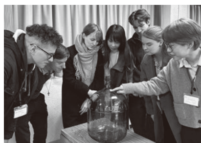
Acid-Resistant Bottles Used for Chemical Storage (More than 40 years old)