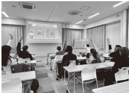
Trying the Recycling Quiz

Pellets, workwear, new bottles, and other recycled products