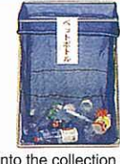
Into the collection net