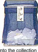
Into the collection net