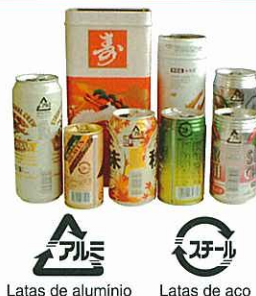
Latas de aluminio Latas de aço