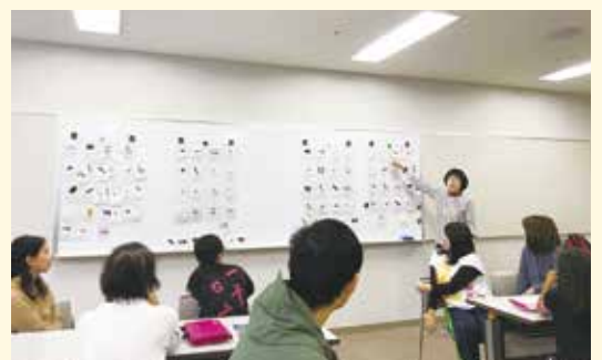
Disaster Prevention Workshop for Foreign Residents

There are around 48,000 foreigners living in Gifu Prefecture at present. In the event of a large-scale disaster such as a large earthquake, those who do not understand much Japanese will need support. On 12 th November, we held a Volunteer Training Workshop to Support Foreign Residents in a Disaster and a Disaster Prevention Workshop for Foreign Residents at Wakakusa Plaza, Seki General Welfare Hall. (Details will be posted in the next issue)