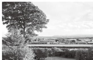
The view from my house in N. Ireland

Over the last few years, Northern Ireland's beautiful natural landscape has been attracting increasing numbers of tourists. It's quite a distance from Japan, but if you ever get the chance, please make a trip to Northern Ireland!