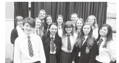
School life in N. Ireland