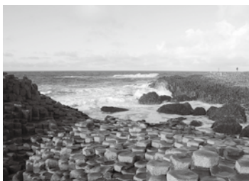
The Giant's Causeway

Before moving to Gifu, I was living in Northern Ireland, a part of the UK which makes up only 3% of the country's population. Although Northern Ireland shares a border with the Republic of Ireland to the south and west, when Ireland was partitioned in 1921, the North remained a part of the UK. As a result, Northern Ireland has a unique mixture of British and Irish culture. My family live by a small village near the capital city of Belfast. Our next-door neighbors are farmers who farm potatoes, barley, cows and sheep. The neighbors' children love farming, and the eldest has been driving a tractor around helping his dad since he started secondary school.