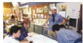
Last year's community event.