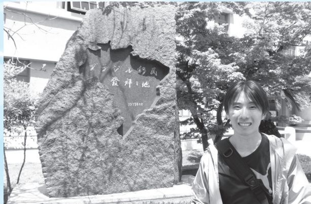
In front of the Kobe Center for Overseas Immigration and Cultural Interaction ( April 2013)

He spoke enthusiastically about how after finishing the scholarship, he would like to work in the automisation industry in Japan and Brazil, and to turn his practical studies into real expreince.