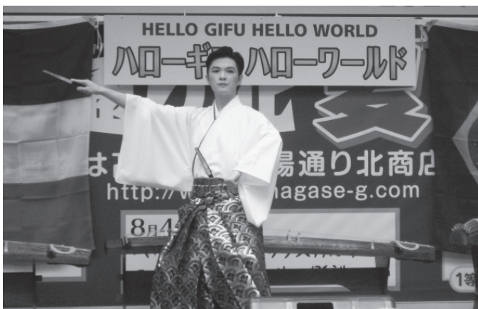
▲Japanese dance performance

Japanese and international residents were able to mix through a variety of activities, and everybody was able to enjoy different cultures, and increase their international understanding.