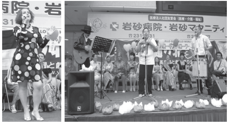
Nodo Jiman International Singing Contest

At the Nodo Jiman International singing contest, 14 groups made up of a total of 25 people representing 11 different countries performed songs from their home countries or Japan. There were people wearing ethnic clothing from their own countries or Japan, which really made the stage come alive.